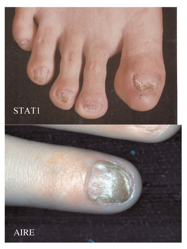
Figure 1: Typical nail changes found in patients with CMCC due to mutations in AIRE or in STAT1, as indicated.